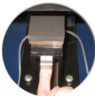
Quick Release Lower Platen