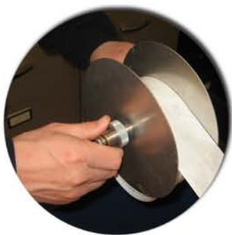
Quick Change Over Design