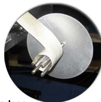
Core-less Take up Reel