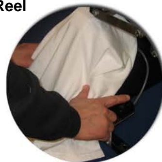
2-Hand Anti-tiedown Activation