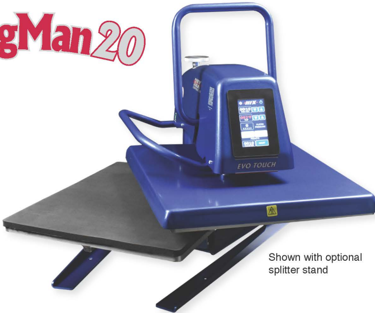
Shown with optional splitter stand