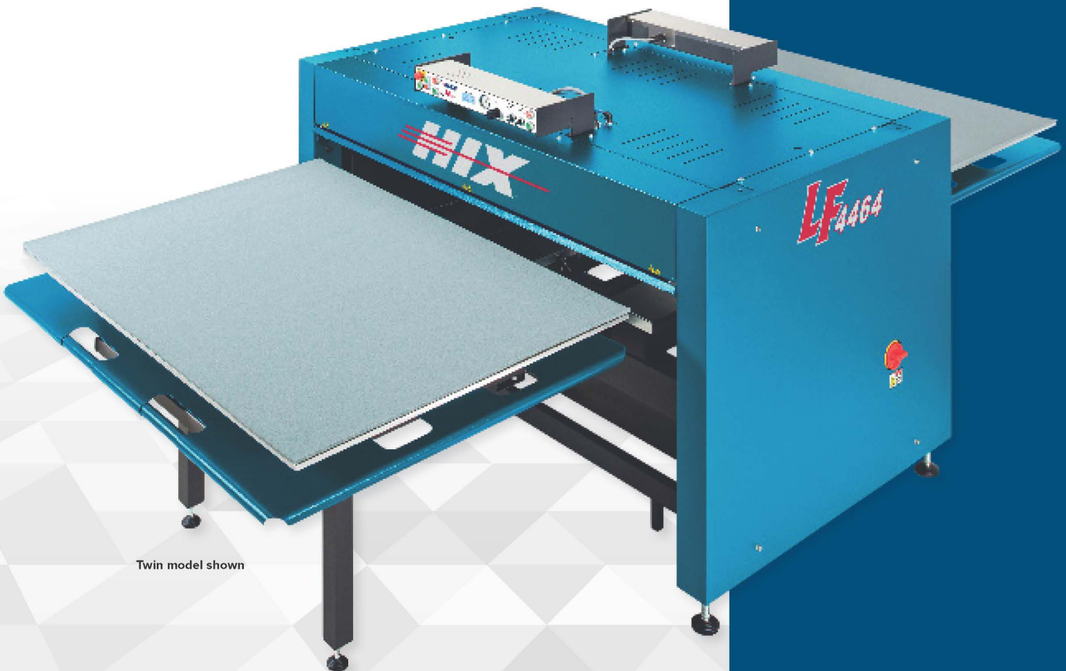
Twin model shown