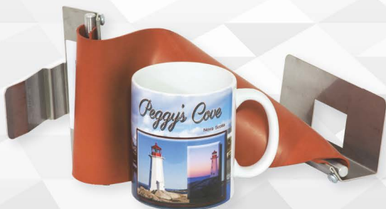
4" Straight Mug Wrap (shown with 11oz mug)