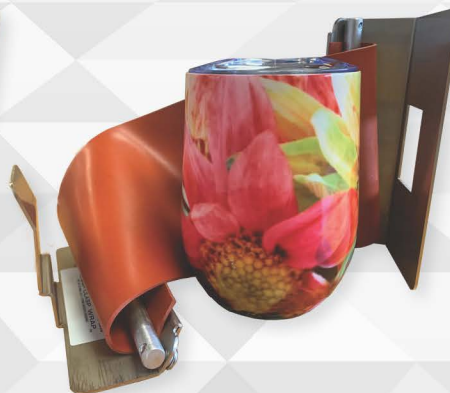
Custom Mug Wrap (shown with curved wine mug)