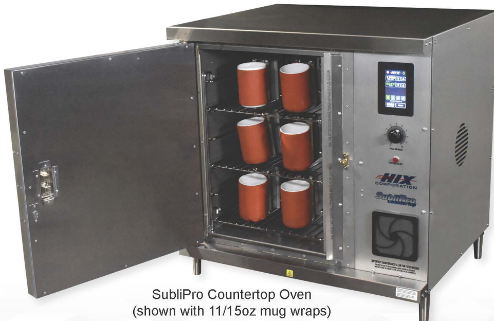
SubliPro Countertop Oven (shown with 11/15oz mug wraps)

★ Promotional Wrap Pricing available with purchase of a new SubliPro® Oven. Purchase an unlimited quantity of any style mug wraps at a 25% discount.